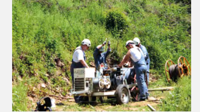
Works on the alignment of the 110+20kV Vuhred-Podvelka and 110+20kV Podvelka-Ožbalt transmission lines